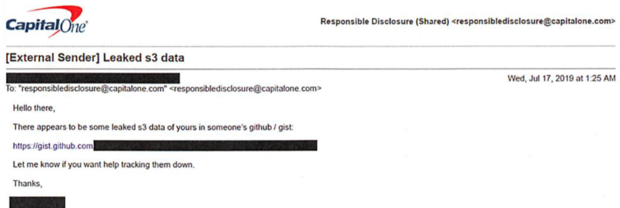
Figure 1: E-mail reporting supposed leaked data belonging to Capital One

According to the FAQ published by Capital One (Capital One - 7, 2019), the company discovered the incident thanks to their Responsible Disclosure Program on July 17, 2019, instead of being discovered by regular cybersecurity operations. The FBI complaint filed with the Seattle court (US District Court at Seattle, 2019) displays an e-mail from an outsider informing that data from Capital One's customers was available on a GitHub page (see screenshot extracted from FBI report).